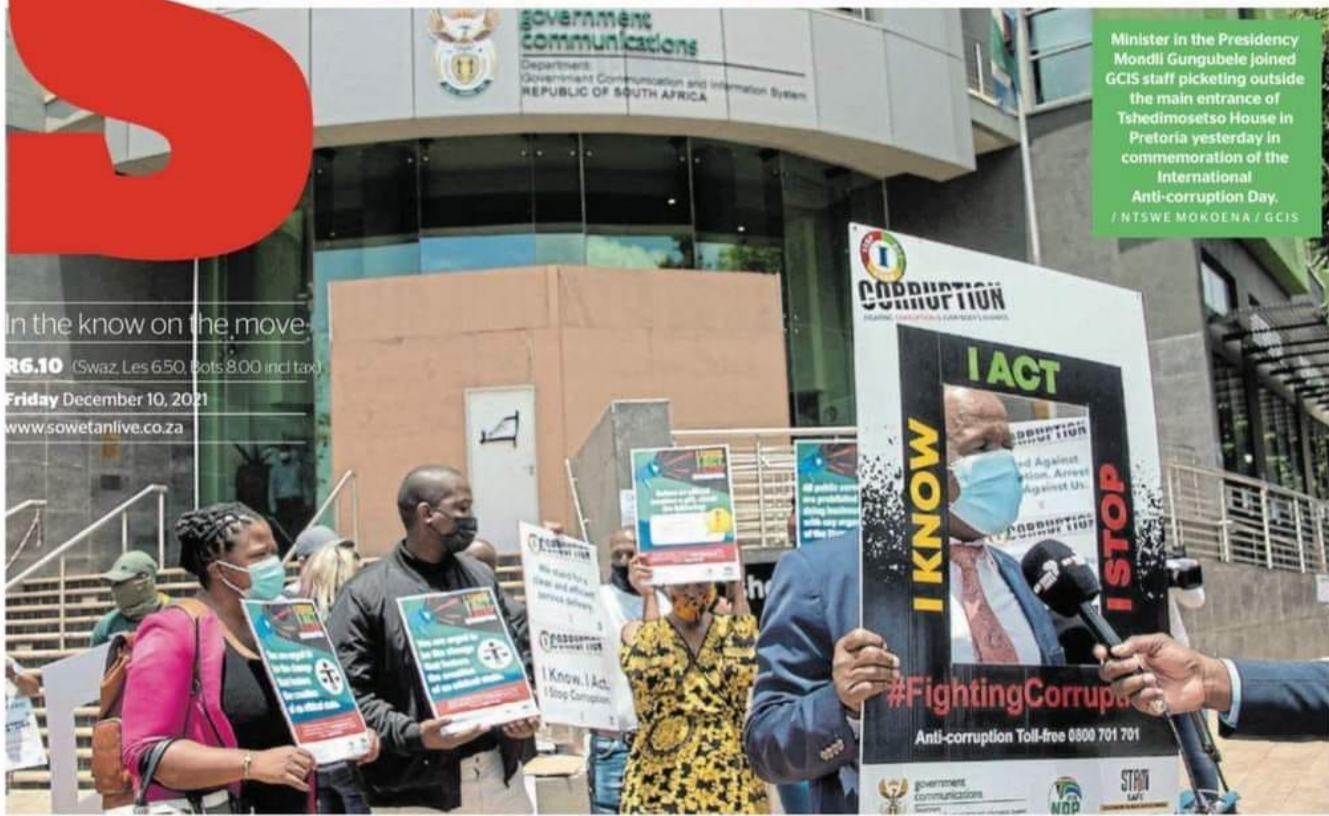
Minister in the Presidency Mondli Gungubele joined GCIS staff picketing outside the main entrance of Tshedimosetso House in Pretoria yesterday in commemoration of the International Anti-corruption Day.

In the know on the move R6.10 (Swaz, Les 6.50, Botz 8.00 incl tax) Friday December 10, 2021 www.sowetanlive.co.za