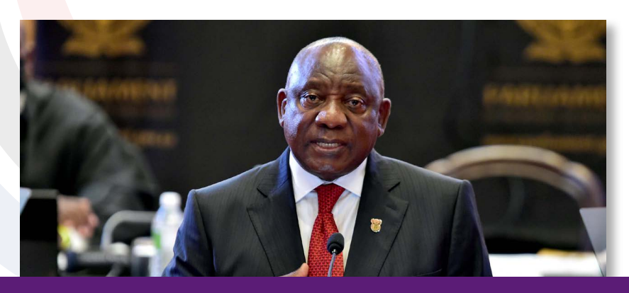
The path we choose now will determine the course for future generations.

The State of the Nation Address in February 2022 identified bold, decisive actions to address the urgent challenges that our country faces. It was about building a new consensus to take South Africa forward. And it was about leaving no one behind.