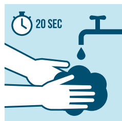
WASH HANDS WITH WATER AND SOAP/SANITIZER, AT LEAST 20 SECONDS