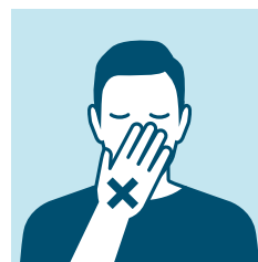
DON'T TOUCH EYES, NOSE OR MOUTH WITH UNWASHED HANDS