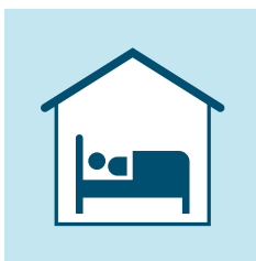
STAY AT HOME