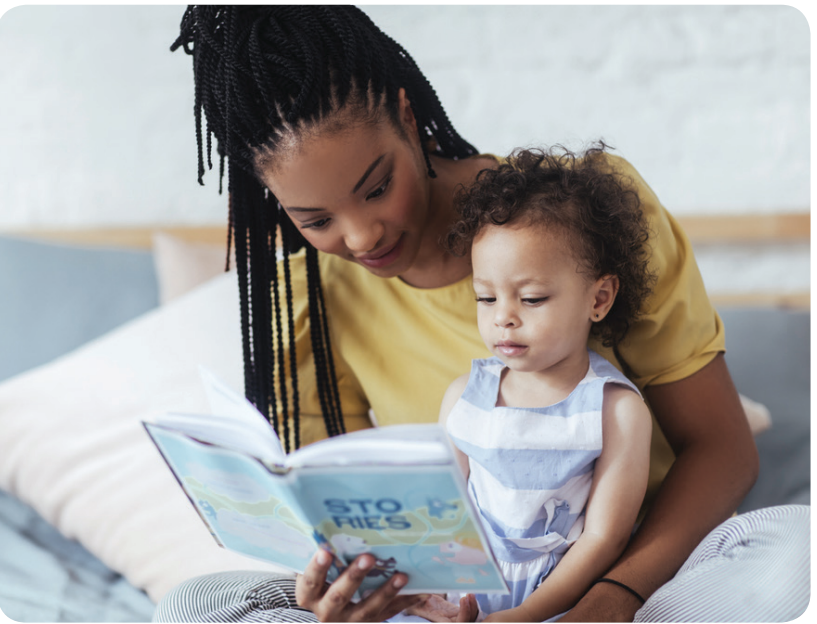
Court Judgement of November 2017, wherein the Department of Social Development was ordered to prepare and introduce the necessary amendments to the Children's Act, 2005 (Act 38 of 2005) in respect to the legal solution towards the management of the foster-care system.

Children's Amendment Bill Cabinet approved the publication of the Bill in the Government Gazette for public comments. The Bill seeks to strengthen coordination of the child-care and protection system through interdepartmental and intersectoral collaboration. The amendments respond to the North Gauteng High