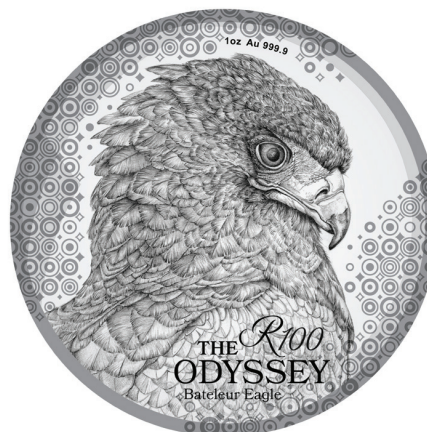
Reverse: R100 (1 oz) 24ct gold coin