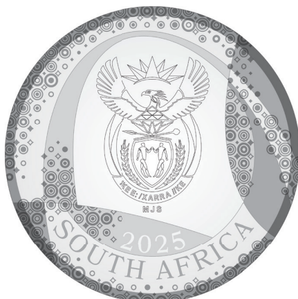
Obverse: R100 (1 oz) 24ct gold coin

Please note that the obverse design is the same for each gold and silver coin within The Odyssey 2025 series. The reverse designs feature a bateleur eagle portrait on all gold coins and a flying eagle on all fine-silver coins. The denomination, hallmark and pattern design are adapted to the specific coin format.