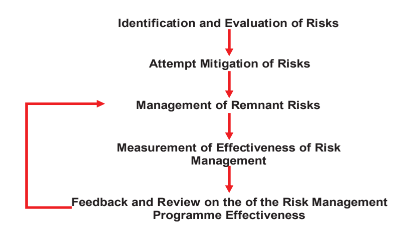
FIGURE 1: GENERIC EXAMPLE OF A RISK MANAGEMENT APPROACH