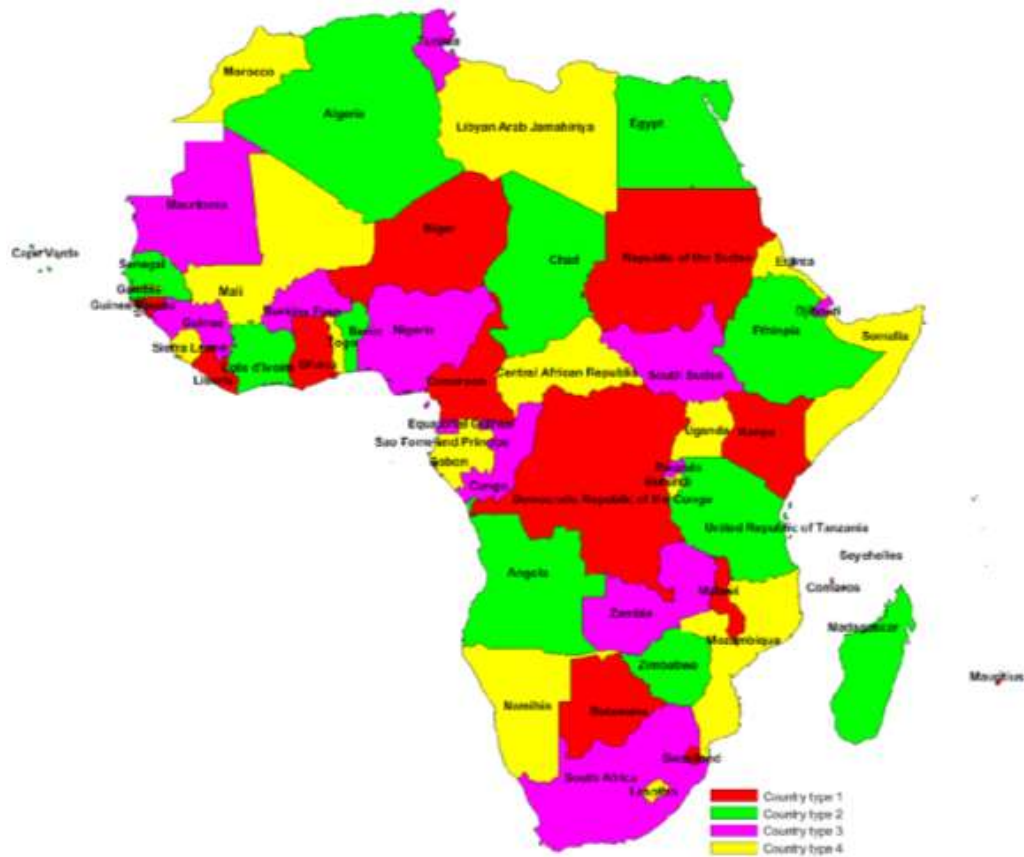
Figure 2: Country type map/PCI distribution map

For each type of country, the following tables and figure describe the sharing of the PCIs with its neighbouring countries, with the following conventions of writing: