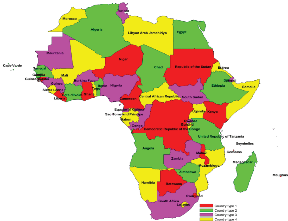
Figure 2: Country type map/PCI distribution map

/multilateral coordination agreements as necessary and may include further subdivision of the allocated codes in certain areas.