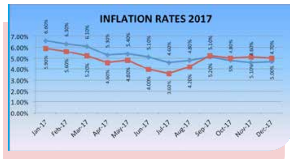
Figure1: CPI/PPI 2017

Some of the above issues triggered the establishment of special interventions in the form of response task teams to address the challenges.