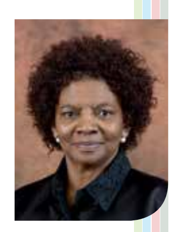
N Mfeketo, MP Minister for Human Settlements