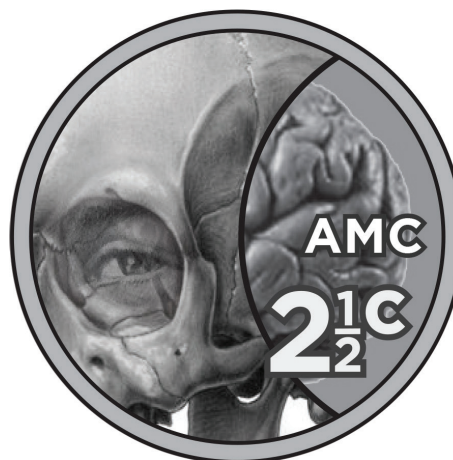
Reverse: 2 1/2 c Tickey (Ag 925 Cu 75)