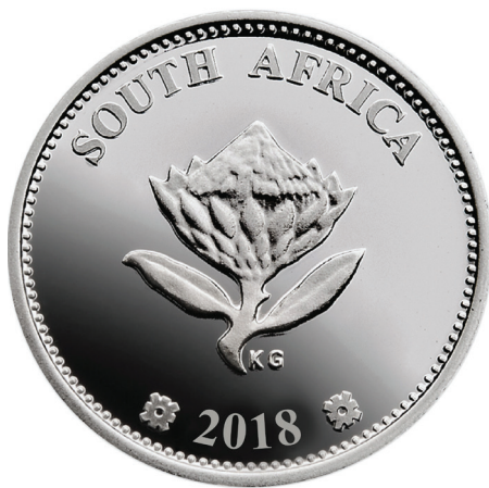
Obverse: 2 1/2 c Tickey (Ag 925 Cu 75)