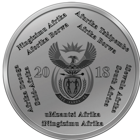
Obverse: R2 Crown (1oz, Ag 925 Cu 75)