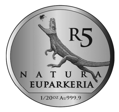
Obverse: R5 (1/20oz, Au 999.9)