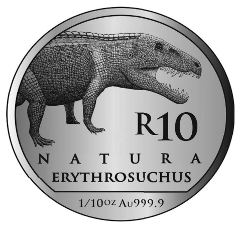
Reverse: R10 (1/10oz, Au 999.9)