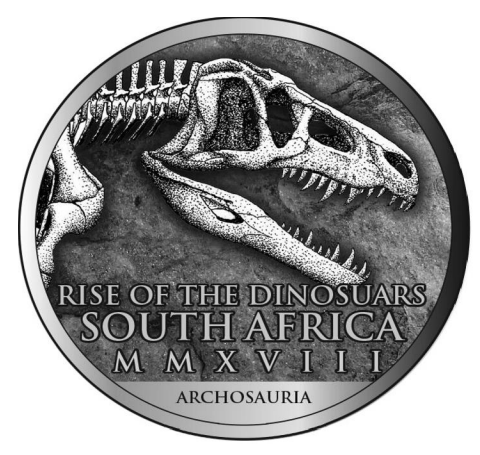
Common obverse (1oz, 1/2oz, 1/4oz, 1/10oz and 1/20oz)