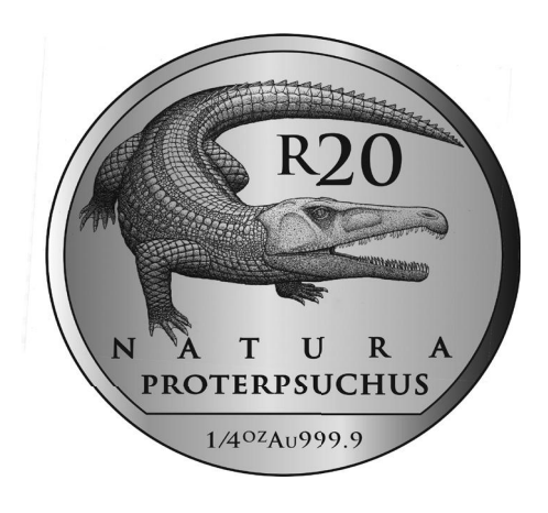
Reverse: R20 (1/4oz, Au 999.9)