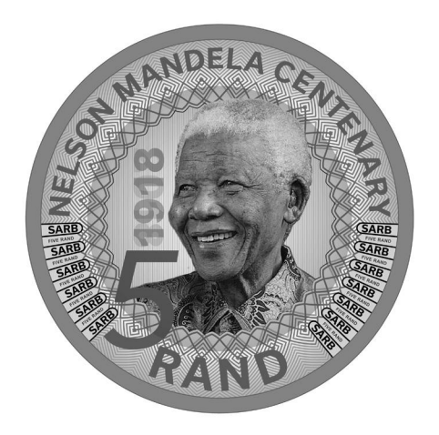
Reverse: R5 circulation coin