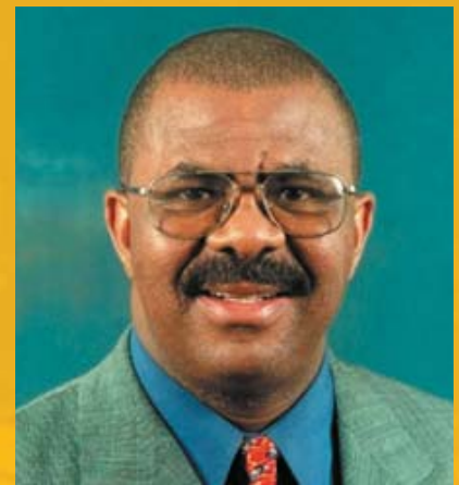
Mr MMS Mdladlana Minister of Labour

It is my belief that through the NSDS 2005 – 2010, together with our social partners, we will support