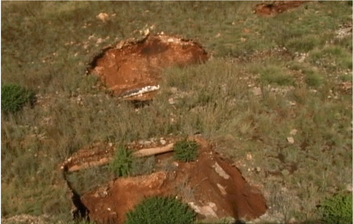
PLATE 5: SINKHOLE AS RESULT OF LEAKING WATER MAINS