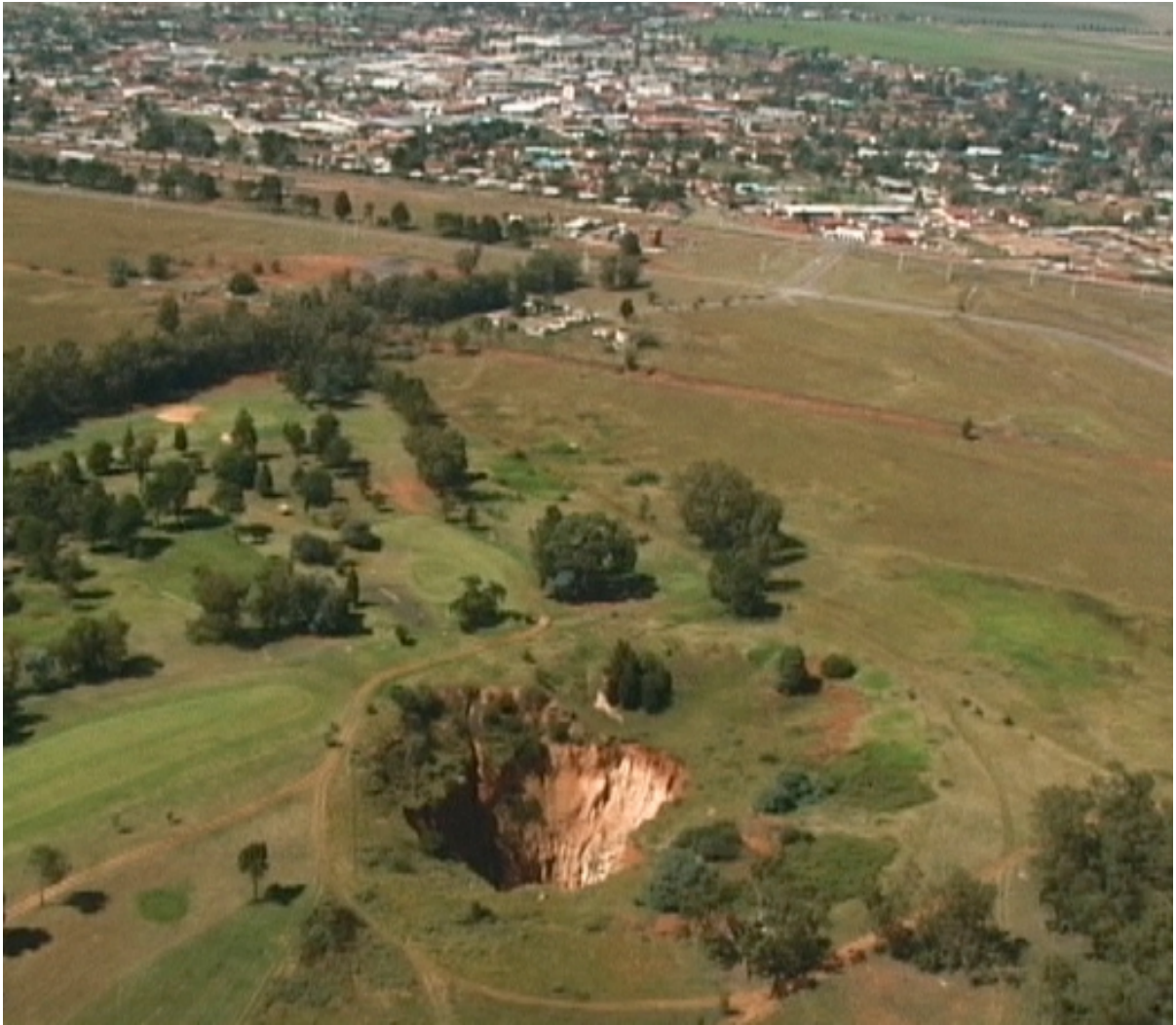
PLATE 7: LARGE SINKHOLE AS RESULT OF DEWATERING