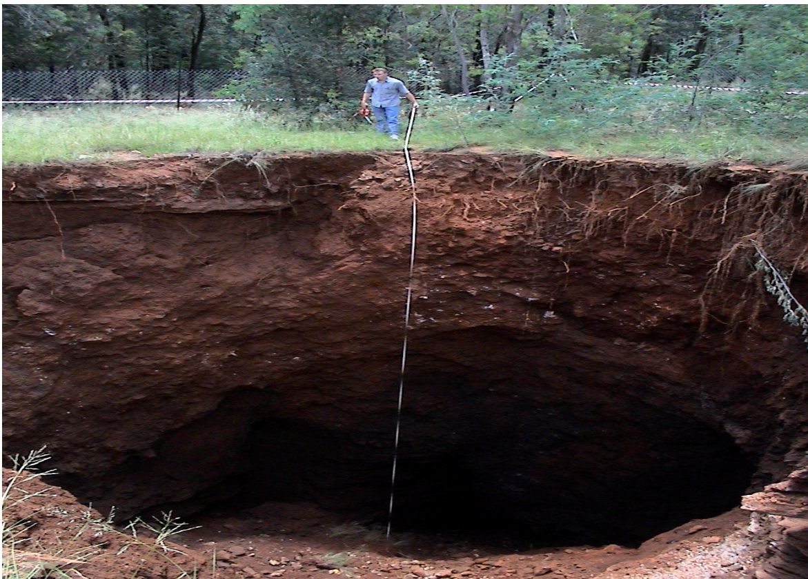
PLATE 4: SINKHOLE AS RESULT OF STORM WATER INGRESS