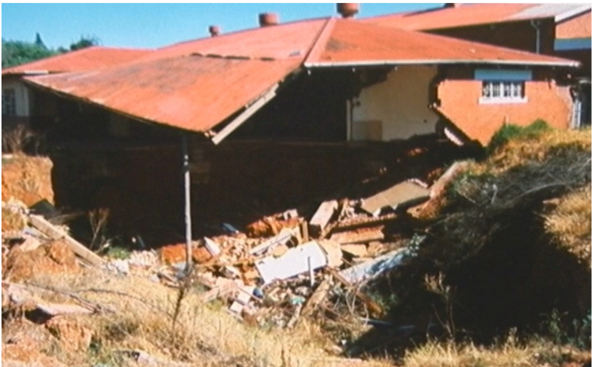
PLATE 6: SINKHOLE AS RESULT OF LEAKING WET SERVICE