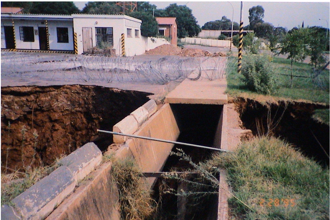
PLATE 2: SINKHOLE AS RESULT OF LEAKING STORM WATER CANAL