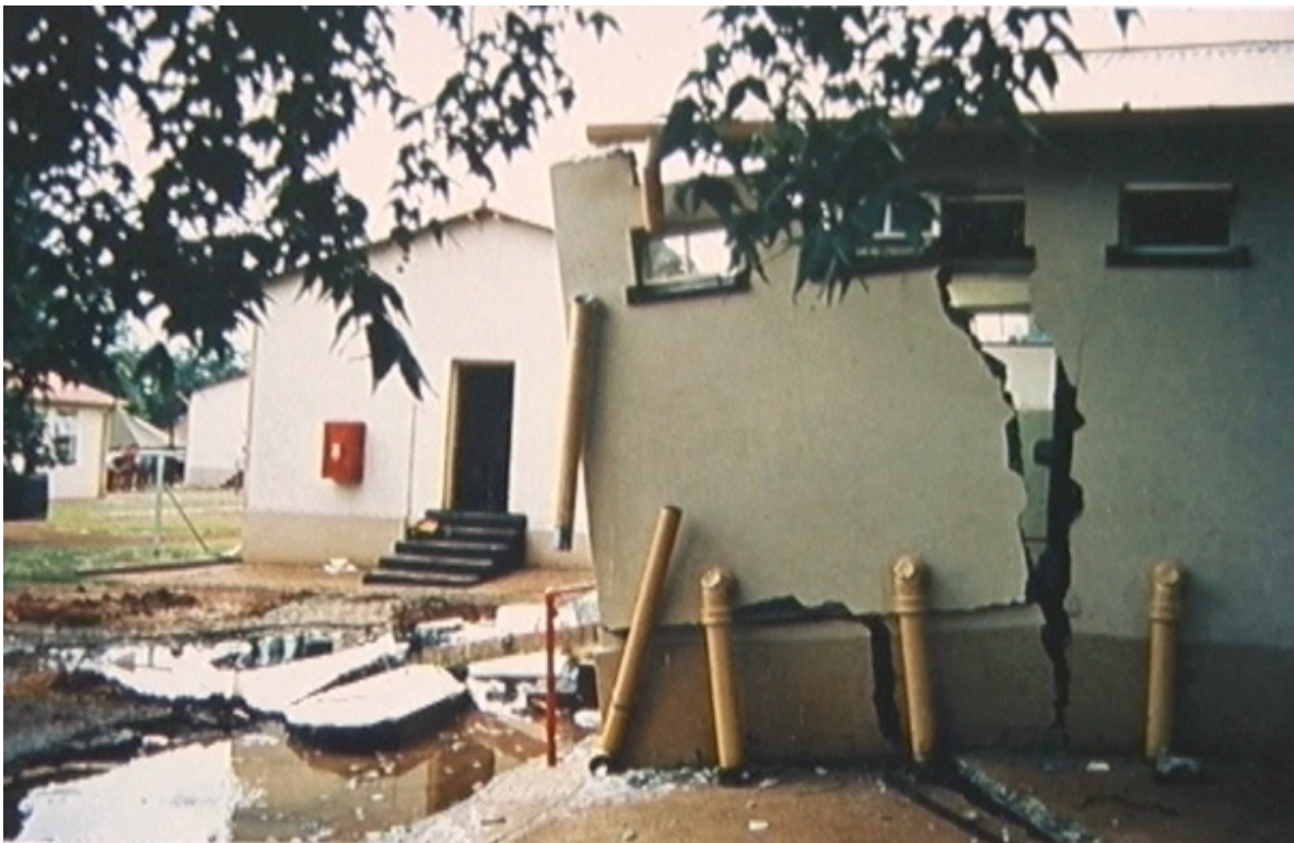
PLATE 9: BUILDING MOVEMENT AS RESULT OF DOLINE FORMATION