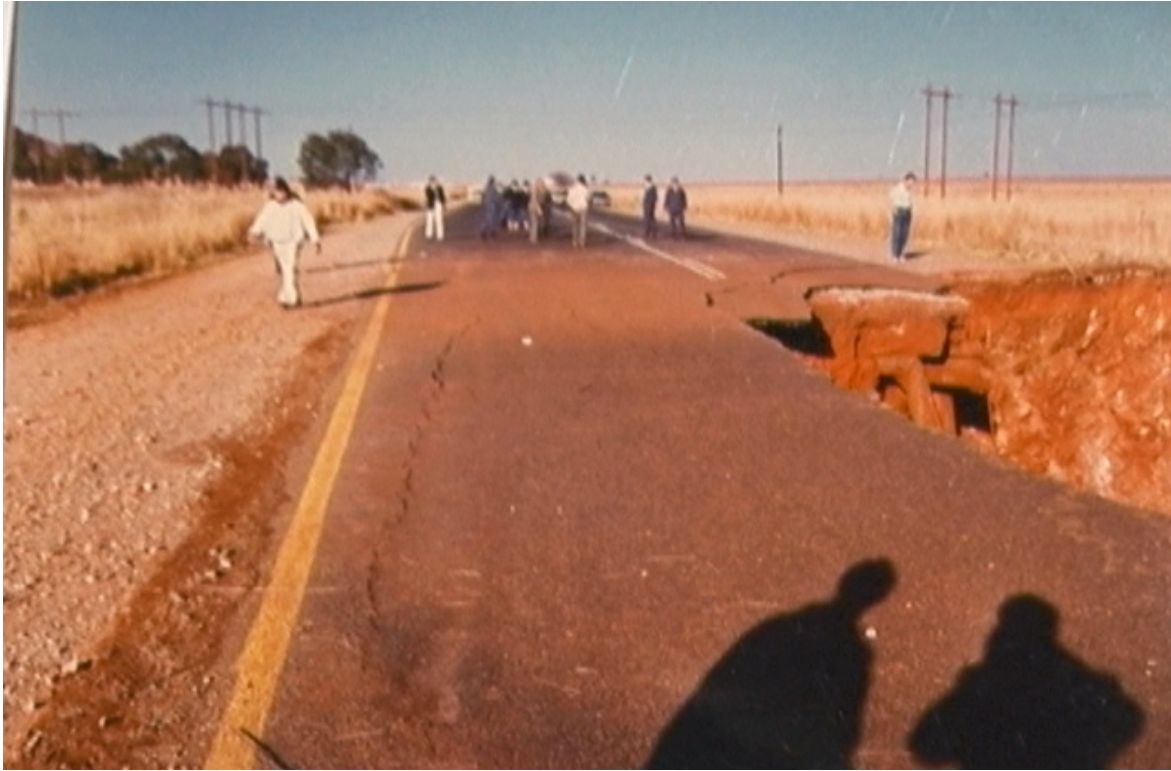
PLATE 3: SINKHOLE ON HIGHWAY (AS RESULT OF LEAKING WATER PIPE)