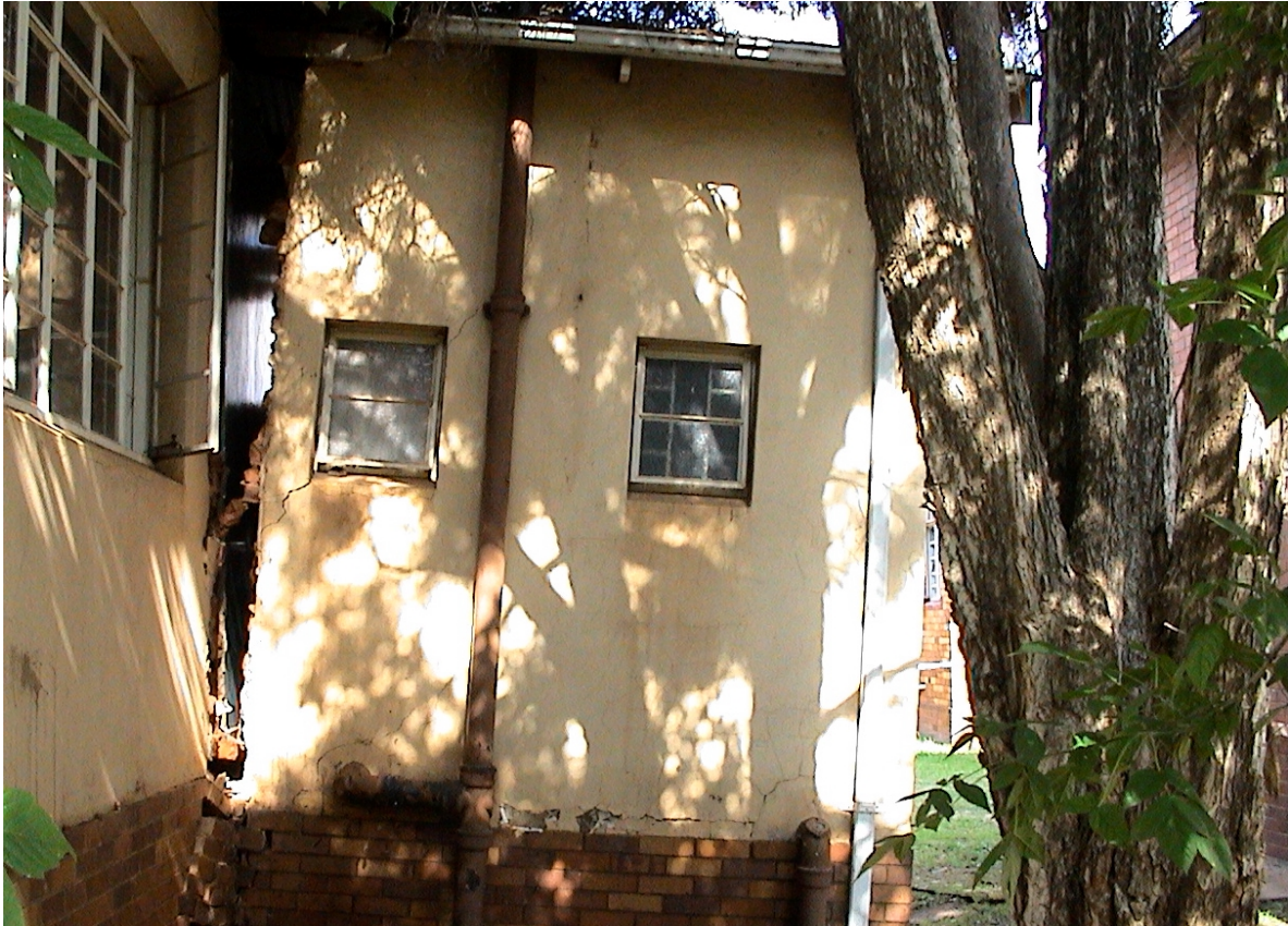
PLATE 8: BUILDING MOVEMENT AS RESULT OF DOLINE