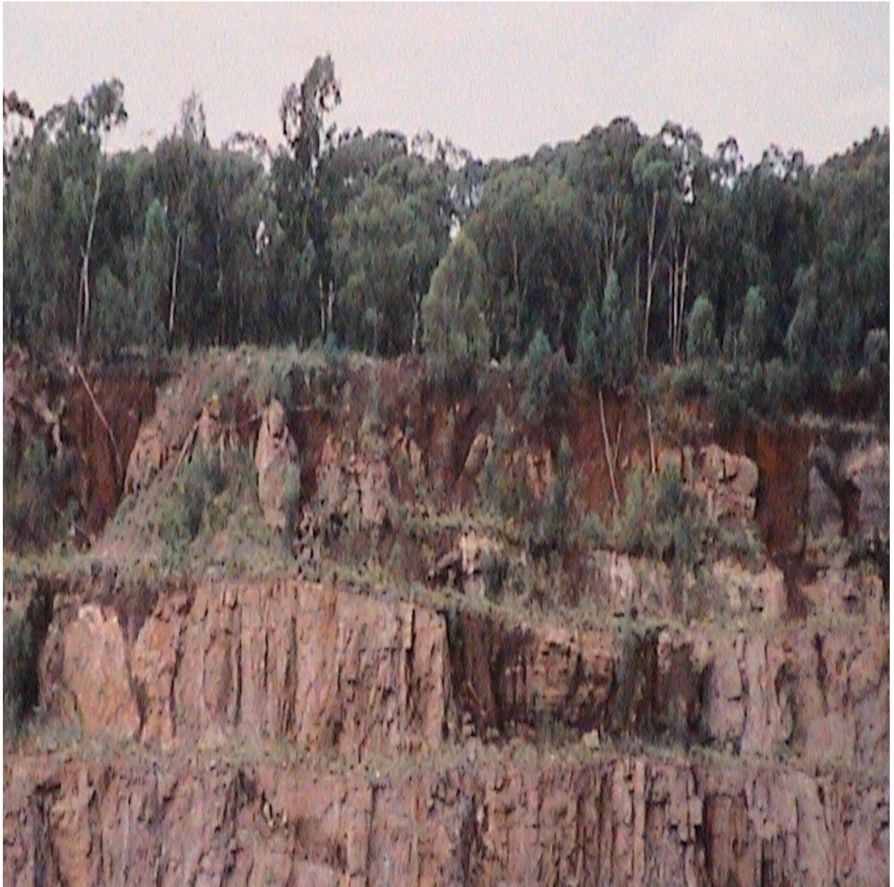
FIGURE 3: SUBSURFACE DOLOMITE PROFILE SHOWING PINNACLES AND SOIL FILLED FRACTURE ZONES