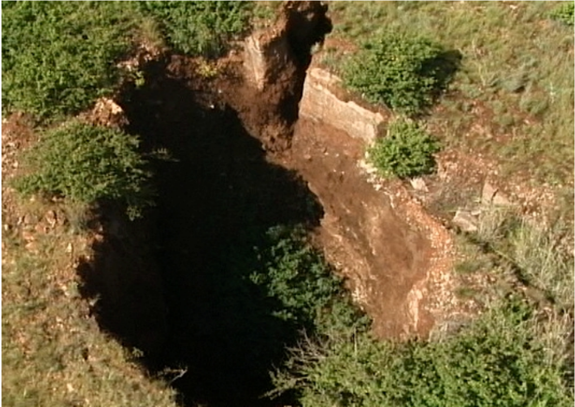
PLATE 1: TYPICAL SINKHOLE (50 M DEEP)