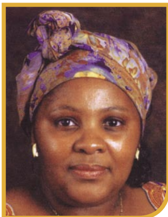
Ms NN Mapisa-Nqakula