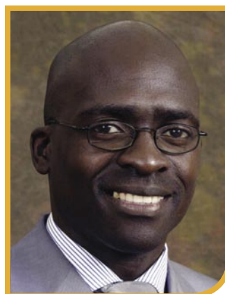
Mr MKN Gigaba