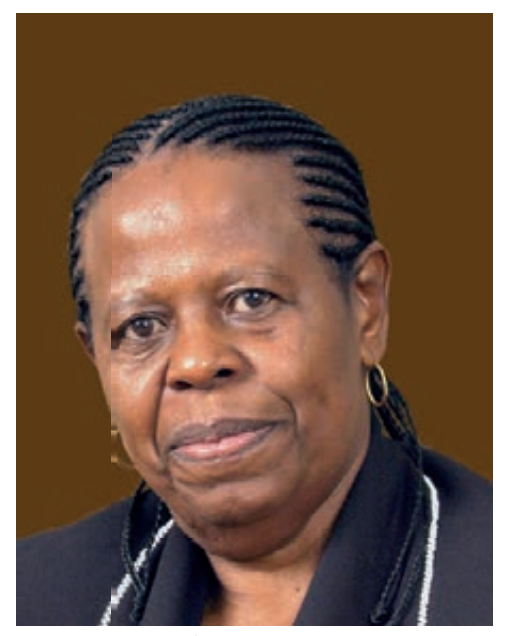
Deputy Minister of Water and Environmental Affairs - Ms REJOICE MABUDAFHASI

During the period under review, 01 April 2008 to 31 March 2009, the Minister of Environmental Affairs and Tourism was Mr Marthinus van Schalkwyk, and the Deputy Minister of Environmental Affairs and Tourism was Ms Rejoice Mabudafhasi.