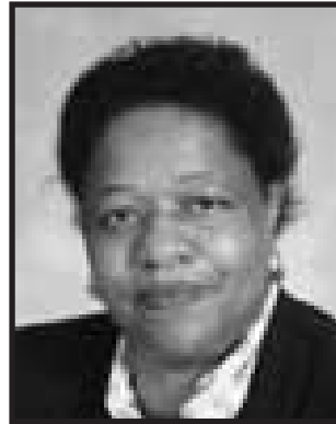
Ms Brigitte Mabandla Deputy Minister of the Department.