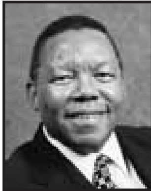
Dr Ben Ngubane Minister of the Department.