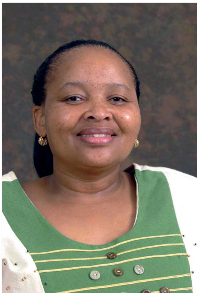
Ms Lulu Xingwana (MP) Minister for Agriculture and Land Affairs

In renewing our pledge—a national partnership to build a better life for all—we embarked on the objective to grow the agricultural land, transform our country's skewed ownership patterns of land and focus on enterprises. These remain critical success factors in our endeavour to strengthen and promote agricultural support services and to eradicate poverty. When we launched Operation Gijima in November 2006, we committed ourselves to fast-track service delivery of departmental programmes that offer support to emerging farming communities in our country. Operation Gijima has identified various areas for speedy implementation, as well as acceleration of service delivery with regard to the implementation of the 2005 Land Summit resolutions, implementation of the Agricultural Broad-based Black Economic Empowerment (AgriBEE) Charter and the promotion of family farming.