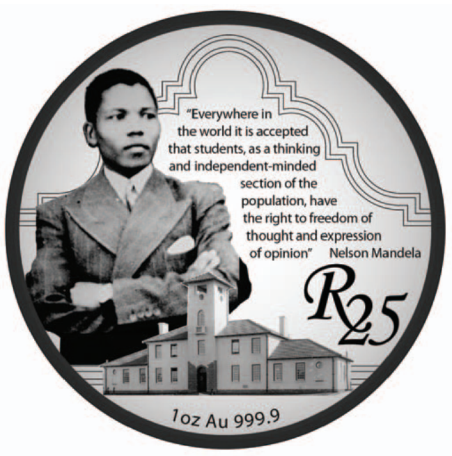
Reverse: R25 (1oz, Au 999.9)