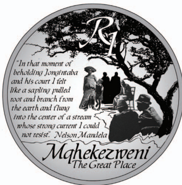
Reverse: R1 (Ag 925, Cu 75)