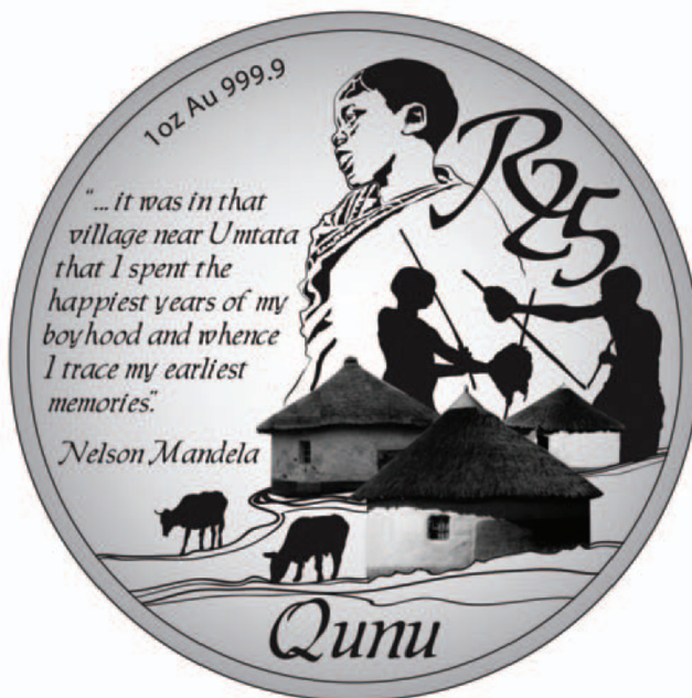
Reverse: R25 (1oz, Au 999.9)