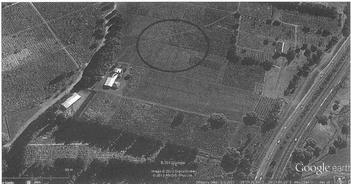
Josiah Tshangana Gumede's grave in Block T Mountain Rise Cemetery, Pietermaritzburg