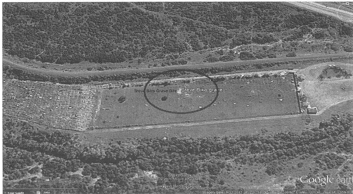
The grave of Stephen Bantu Biko in the Ginsburg Cemetery, King William's Town.