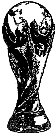
14. FIFA TROPHY II