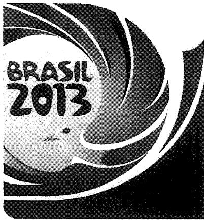
10. BRASIL 2013 FIFA Confederations Cup