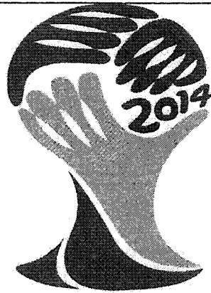
11. 2014 Official Emblem