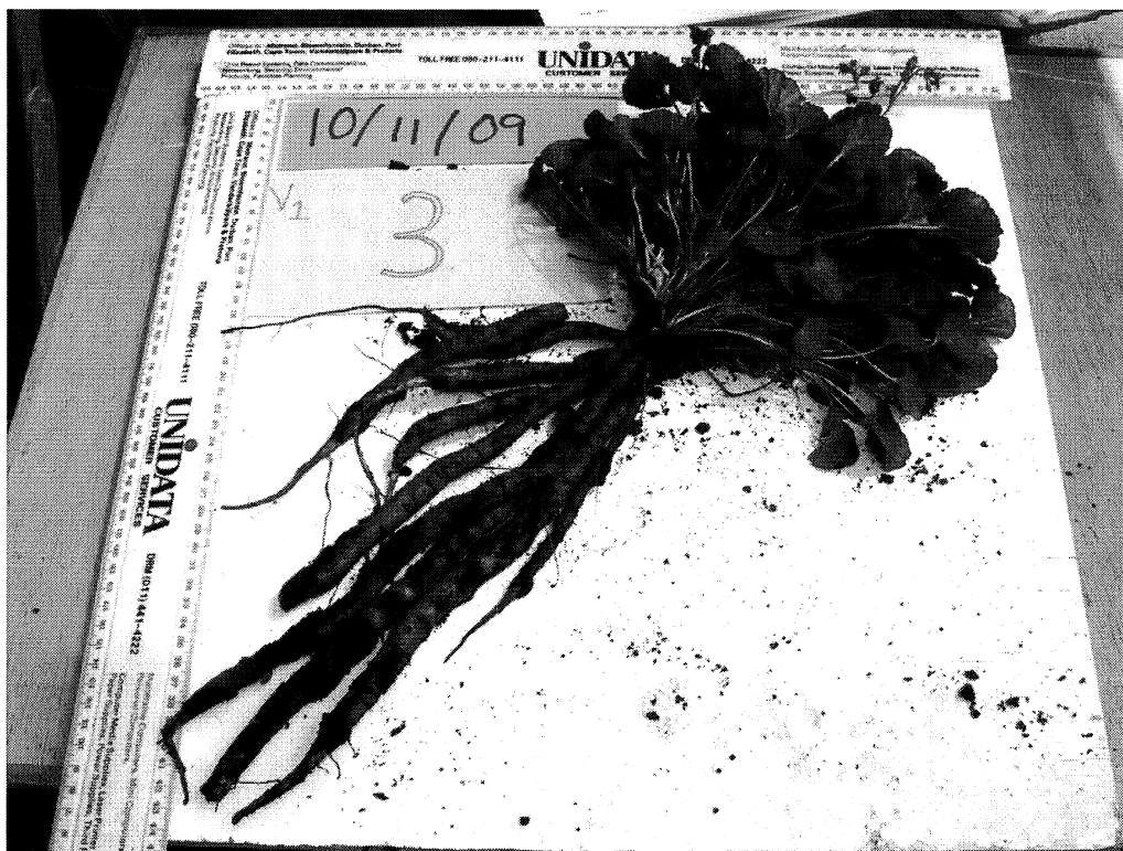
Figure 4. —Prolific eighteen month old regrowth of slender, light coloured lignotubers from mature P. sidoides cutting grown under agricultural conditions.