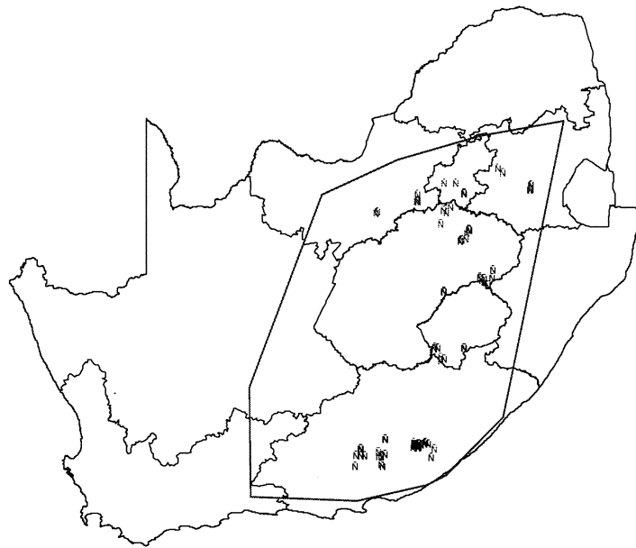
Figure 2. —The 103 sites surveyed within the P. sidoides range (red polygon) as part of the resource assessment carried out by De Castro et al. (2010). Blue sites represent areas where P. sidoides populations occur and red sites represent suitable habitat where no populations were found.