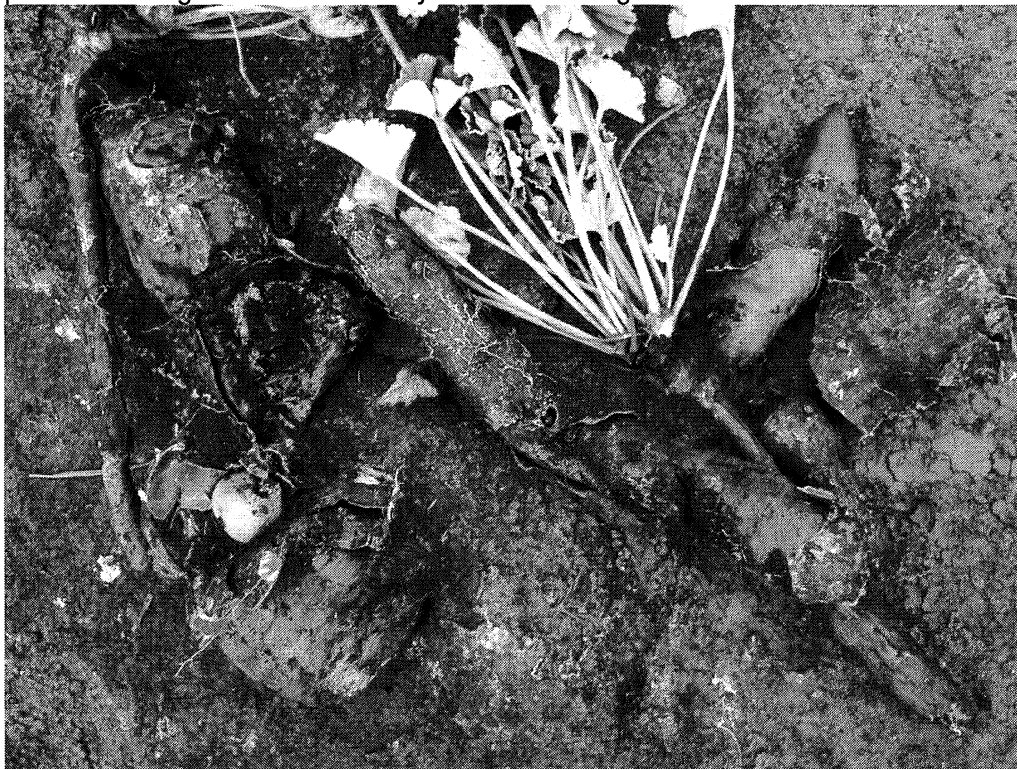
Figure 3. —Mature wild collected P. sidoides plant with large dark pink to red lignotubers.

It should be noted that White's (2007) research was conducted over a short time period and longer term studies may demonstrate higher Umckalin and colour levels.