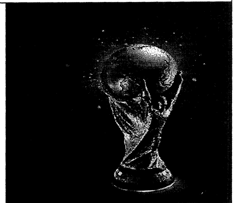
15. FIFA TROPHY III

Interested persons are invited to submit, in writing such representations as they may care to make in regard to this matter to the Registrar of Trade Marks, Private Bag X400, Pretoria, 0001, to reach her within 30 days of the publication of this notice.