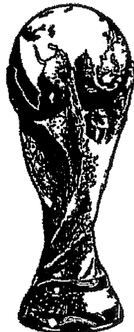
14. FIFA TROPHY II