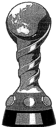
13. FIFA Confederations Cup Trophy