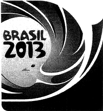
10. BRASIL 2013 FIFA Confederations Cup