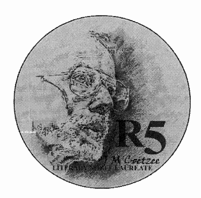
Reverse - R5 (1/10 oz) Gold Protea Coin