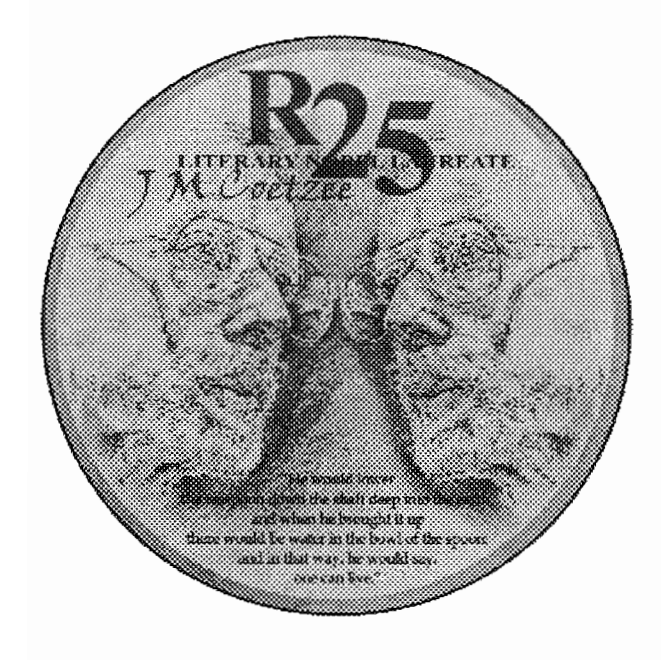
Reverse - R25 (1 oz) Gold Protea Coin