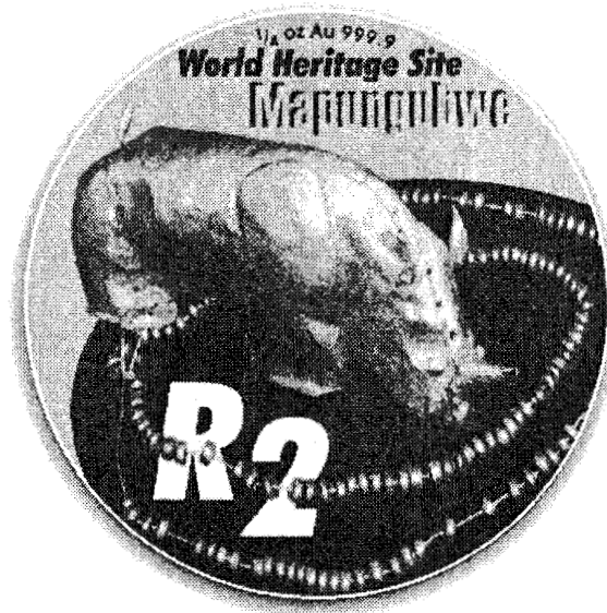
Reverse - R2 (1/4 oz) Gold Heritage Site Coin

WORLD HERITAGE SITE SERIES Mapungubwe Cultural Landscape Home of the Golden Rhinoceros