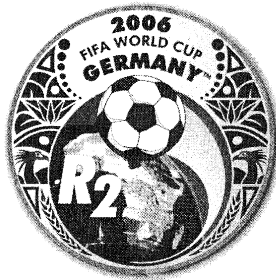
Reverse - R2 (1/4 oz) Gold FIFA Coin

FIFA WORLD CUP SERIES 2006 FIFA World Cup Germany™