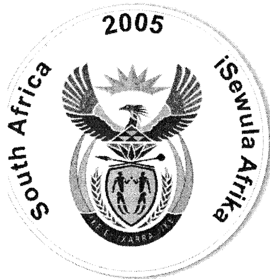
Obverse - R1 (1/10 oz) Gold Cultural Coin