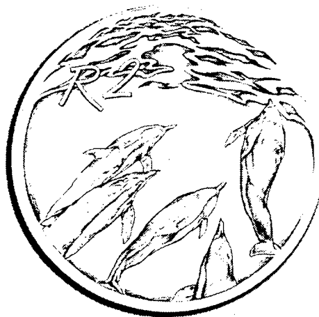
Silver Marine R2