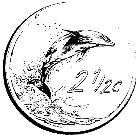
Silver Marine 2 1/2 C Tickey