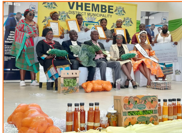
Various leaders and winners at the event.

All the participants beyond this bracket were compensated with an amount of R10 000 from Standard Bank. This was done to safeguard food security and local economic participation by the farmers. The National Youth Development Agency urged young female farmers to visit their offices for financial support and farming developmental programme available for the development of youth in farming.