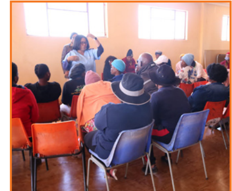
Focus group discussions that were hosted as part of the dialogue.