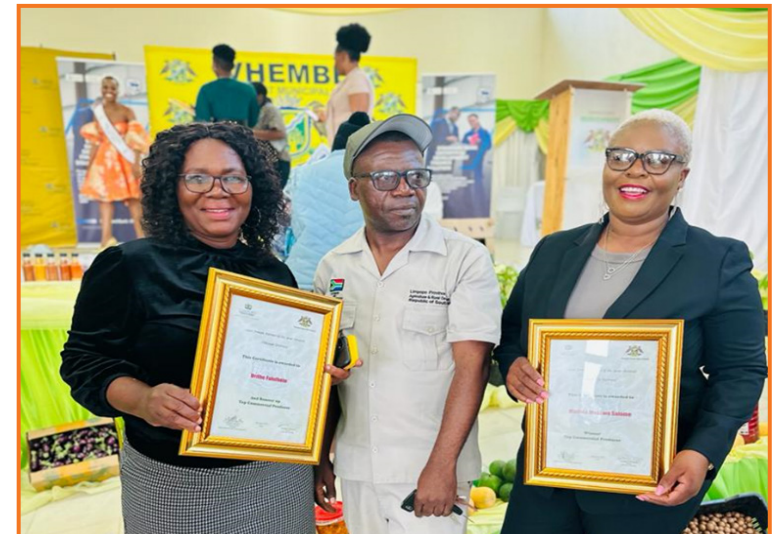
Some of the winners with their prizes.