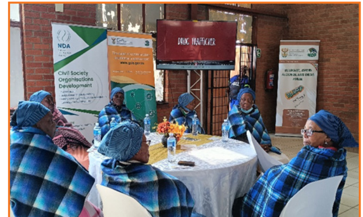
Women discussing various issues including GBV.