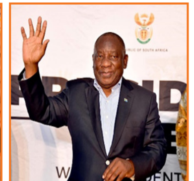
President Ramaphosa interacting with the public at the Imbizo.