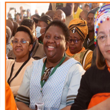
Members of Cabinet together with the community.