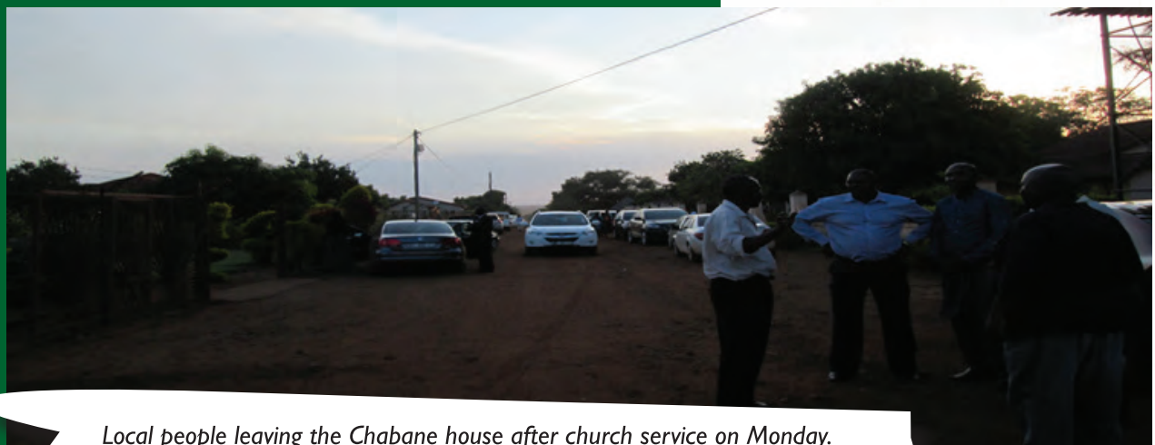
Local people leaving the Chabane house after church service on Monday.