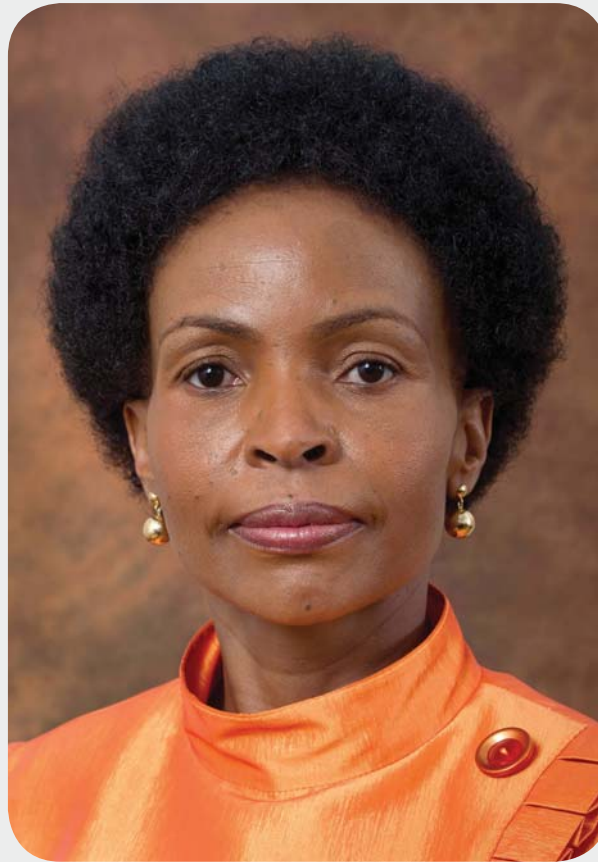
Minister Maite Nkoana-Mashabane Department of International Relations and Cooperation