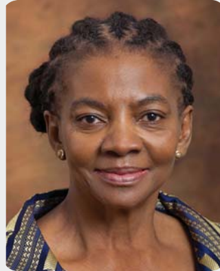
Deputy Minister Nomaindia Mfeketo Department of International Relations and Cooperation

critical organ of the UN at the time that the target date for the achievement of the millennium development goals is fast approaching, in 2015. However, the reform of the UNSC, another principal organ of the UN, remains an issue.