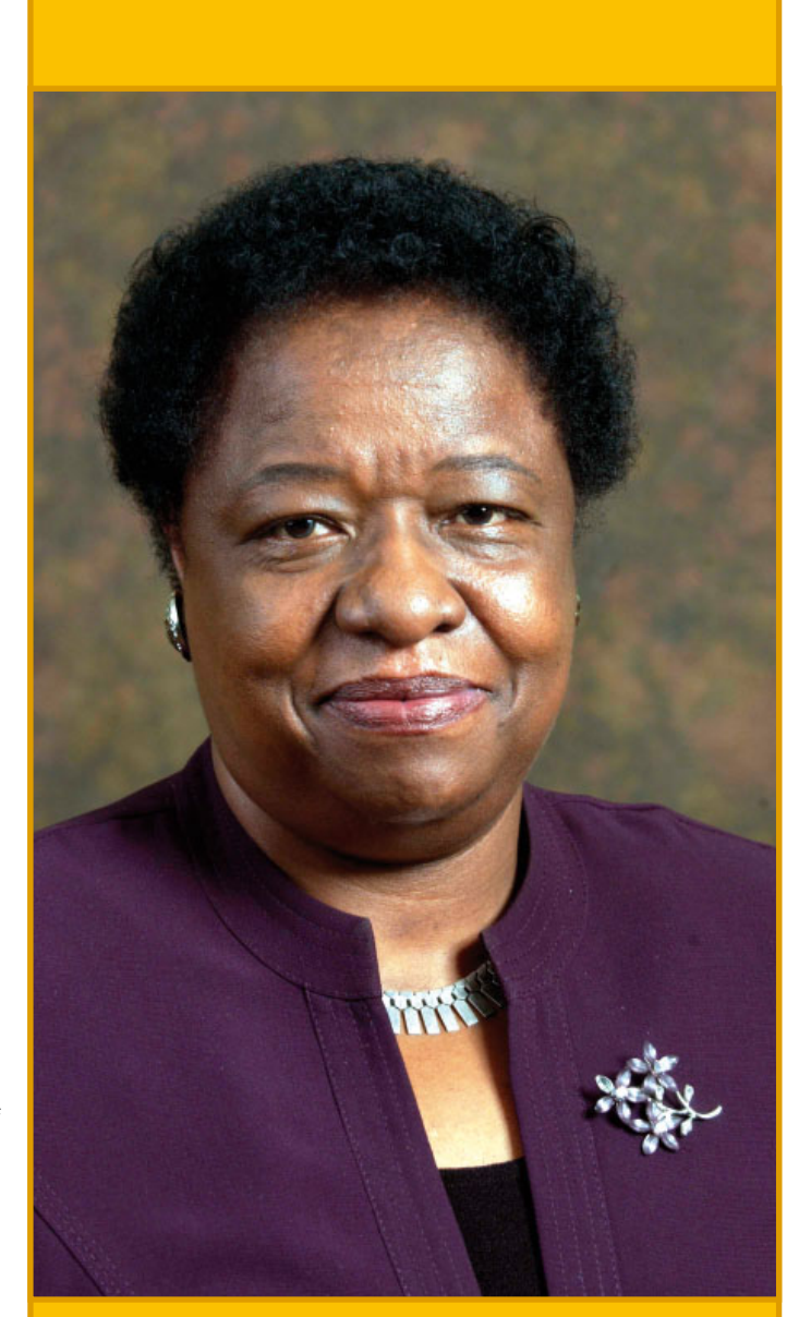
Mrs BS Mabandla, MP Minister for Justice and Constitutional Development

I am confident that with the commitment and dedication of all roleplayers in the criminal justice process, this Victims' Charter will assist in the implementation of the applicable laws in such a way that it serves its purpose - making justice a reality for all!