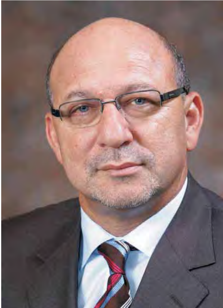
Mr Trevor A Manuel (MP) Minister in Presidency: National Planning