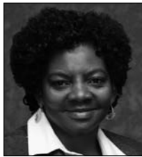
Ms NC Mfeketo Deputy Speaker National Assembly