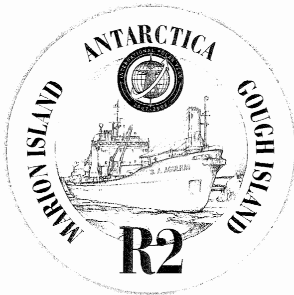
Reverse - R2 Crown Silver Coin