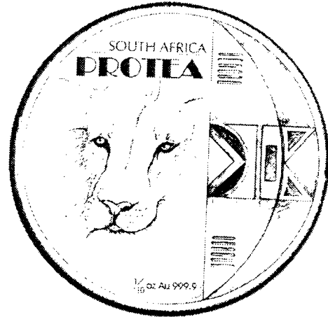
protea 1/10 oz