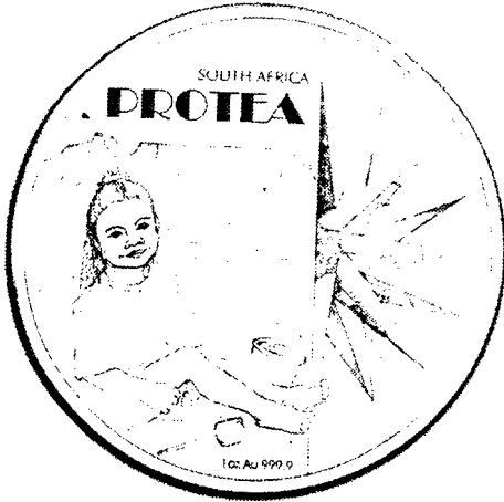
protea 1 oz