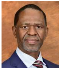
Dr S Dhlomo, MP Deputy Minister of Health

The COVID-19 pandemic brought into sharp focus the many health inequalities that exist in the country, continentally, and globally. We understand health inequalities as variations in health or access to healthcare between different population groups arising from the social conditions in which people live and work, as well as their age. These socio-economic conditions are wide ranging and include factors such as gender, ethnicity, geographic region or neighbourhood, housing, and employment, as well as levels of income and education.