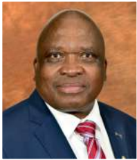
Dr J Phaahla, MP Minister of Health

I am pleased to present the National Department of Health's annual report for the 2022/2023 financial year; a year that saw us emerge from the ruins of the largest public health emergency in modern times.